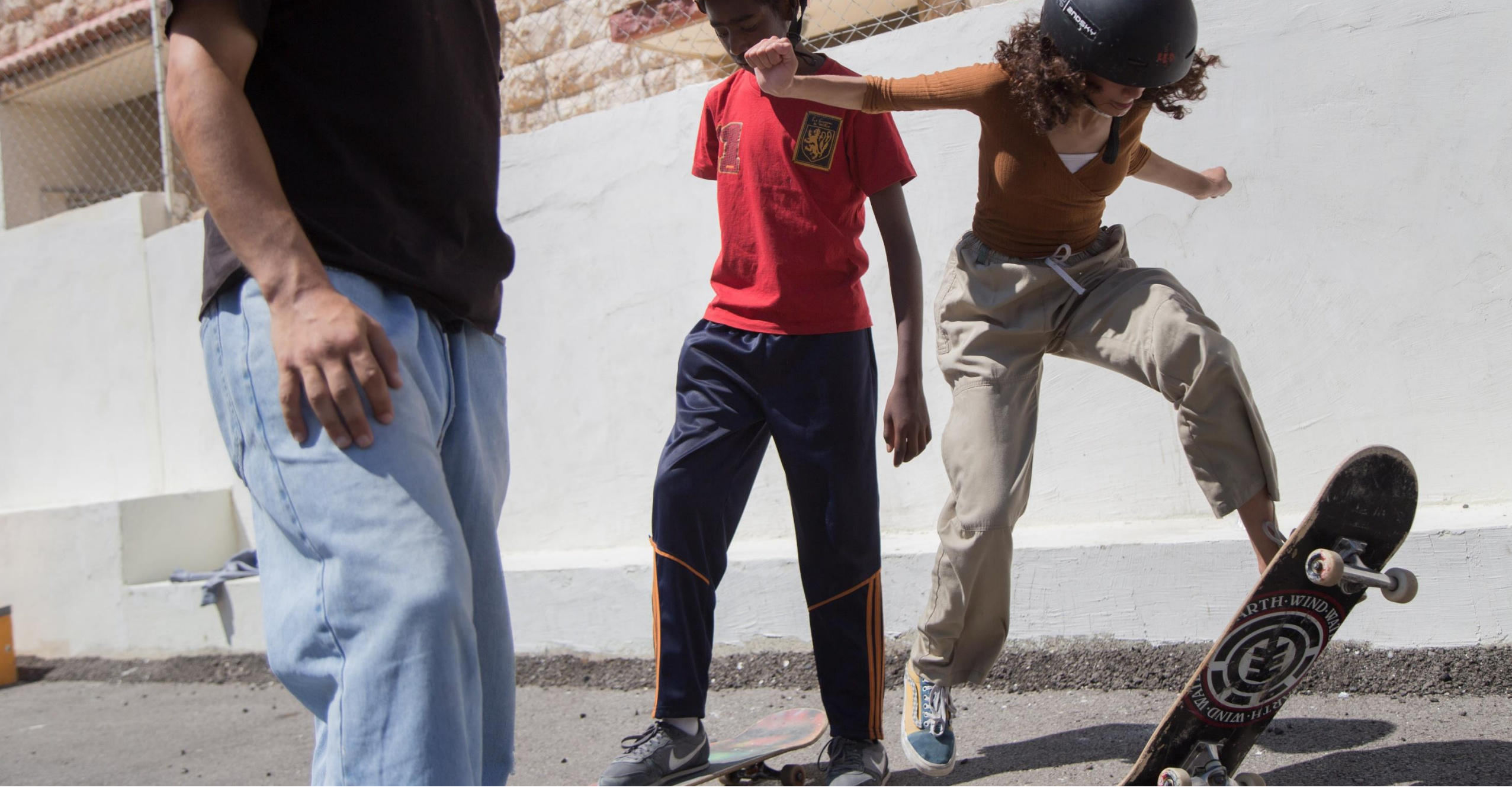
The summer skateboard camp in Jordan aims to create a safe and welcoming environment for young people to develop positive connections with their peers and mentors.