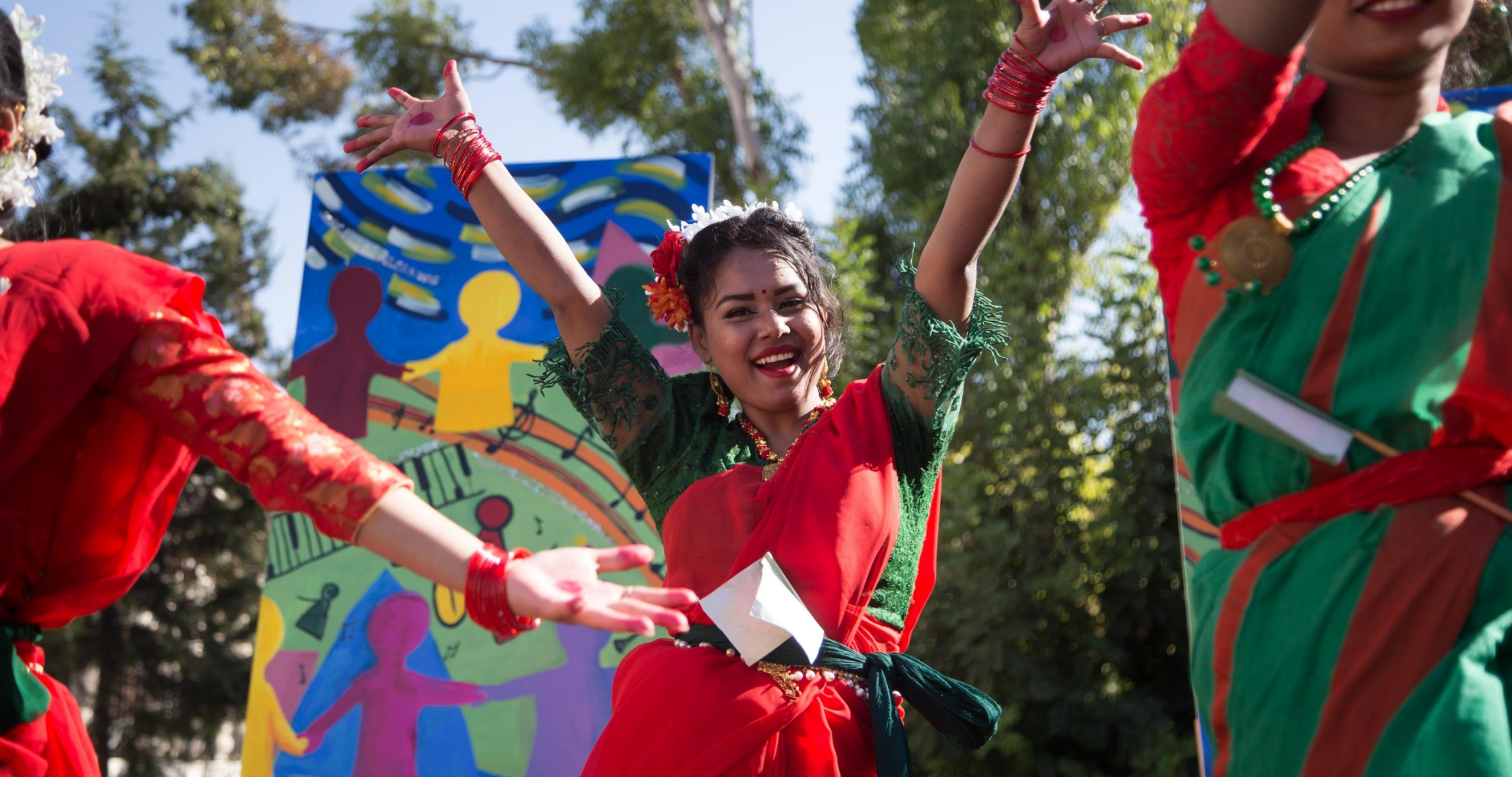
The Festival of Encounter in Jordan is an opportunity to facilitate an environment where different cultures can flourish and grow together.