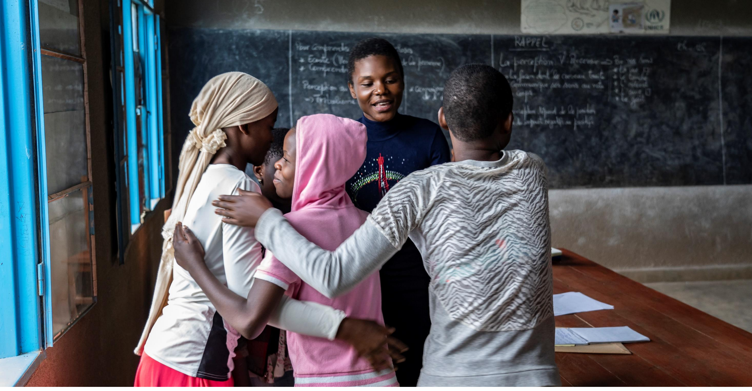
In Ruyigi, Burundi, refugee students participate in activities that encourage the creation of good relationships and foster social cohesion in the camp.