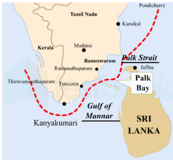
Figure 1. Gulf of Mannar.

Tamils from Sri Lanka crossed the Gulf of Mannar (Figure 1) through the Palk Strait, a strait between Tamil Nadu state of India and the Jaffna District of the Northern Province of Sri Lanka (Figure 2). The influx of Sri Lankan refugees into India was marked by four phases. Totally, 303,076 refugees took refuge in India during those four phases. They settled in small refugee camps all over the state of Tamil Nadu. JRS has been accompanying both the refugees and the IDPs, although JRS's presence in Sri Lanka ended in 2020. However, JRS has been serving the refugees in Tamil Nadu through income generating programs and access to education and livelihoods, since the 1990s. JRS would like to alert about the lack of durable solutions for these forgotten refugees who have spent 40 years in exile.