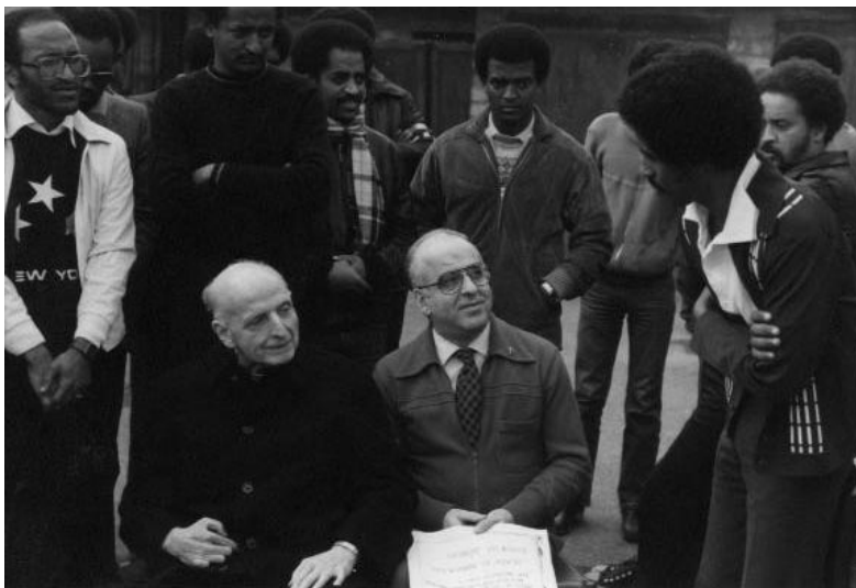
Pedro Arrupe SJ (seated, left) at Centro Astalli, Rome. Jesuit Father General between 1965-1983, Fr Arrupe set up the Jesuit Refugee Service in 1980. It was, he said, his swan song to the Society .