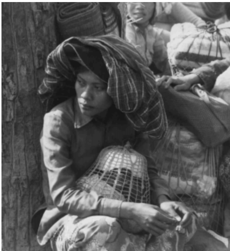
Thailand 1985 A Cambodian woman during evacuation following an attack on refugee camps along the Thai-Cambodian border.