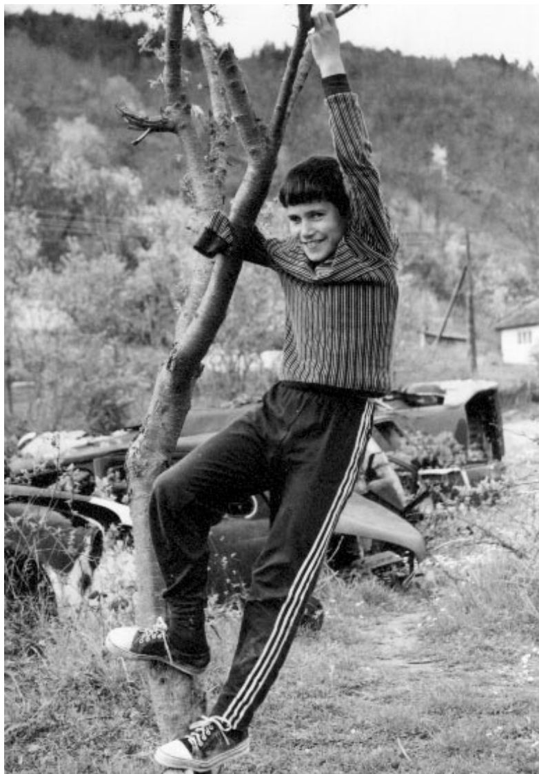
Bosnia 1998 JRS set up projects in Bosnia and Croatia in the aftermath of devastating war. Assistance to landmine victims is an integral part of the work of JRS in southeast Europe, which has now spread to Macedonia and Yugoslavia.