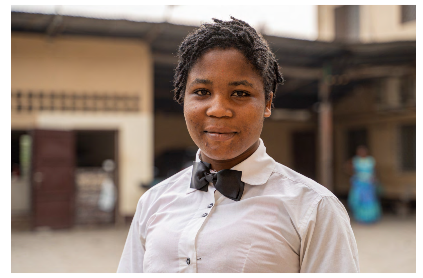
| CEFOMAF - Familly Support Livelihoods Vocational Centre